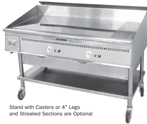
Stand with Casters or 4" Legs and Streaked Sections are Optional

The Keating MIRACLEAN® Griddle is designed to provide maximum performance with many benefits to the operator. The mirror surface is achieved in a special eight step process. High input burners rated at 30,000 BTU/hr. for natural gas are mounted every 12" to ensure performance and recovery allowing the operator to use zone cooking for different products.