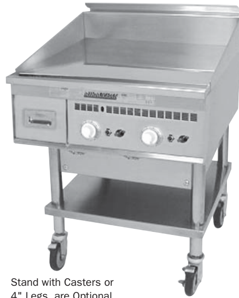
Stand with Casters or 4" Legs are Optional

The Keating MIRACLEAN® Griddle is designed to provide maximum performance with many benefits to the operator. The mirror surface is achieved in a special eight step process. High input burners rated at 30,000 BTU/hr. for natural gas are mounted every 12" to ensure performance and recovery allowing the operator to use zone cooking for different products.