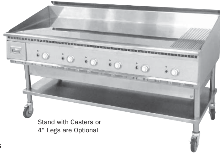
Stand with Casters or 4" Legs are Optional

The Keating MIRACLEAN® Griddle is designed to provide maximum performance with many benefits to the operator. The mirror surface is achieved in a special eight step process. Insulated stainless steel electric elements are mounted every 12" to ensure performance and recovery allowing the operator to use zone cooking for different products.