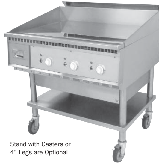
Stand with Casters or 4" Legs are Optional

The Keating MIRACLEAN® Griddle is designed to provide maximum performance with many benefits to the operator. The mirror surface is achieved in a special eight step process. Insulated stainless steel electric elements are mounted every 12" to ensure performance and recovery allowing the operator to use zone cooking for different products.