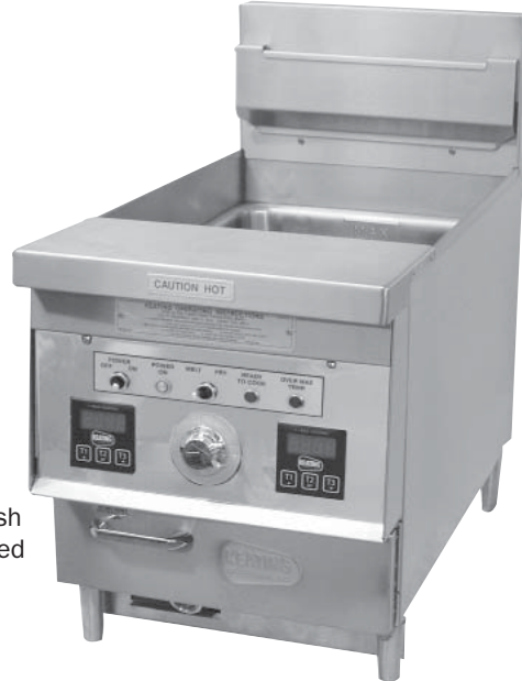
One pair 4 mesh baskets included

The 10x11 BB Electric Counter Model Fryer is ideal for multi-product use.